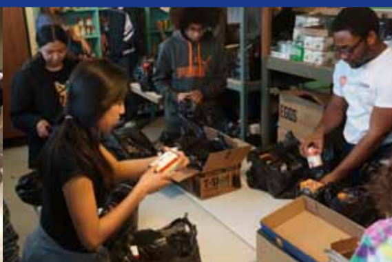
Scholars work in the Family Focus food pantry on the Day of Community Service