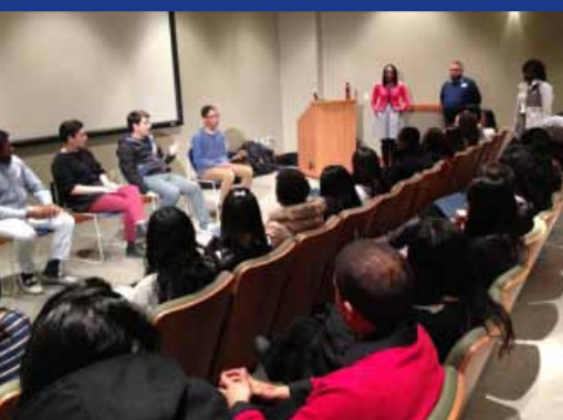
Class of 2014 Q&A with a multicultural student panel at Lawrence University