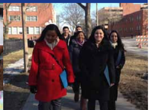
Class of 2015 on a campus tour of the University of Iowa